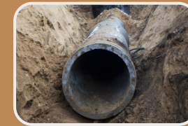
Waste Water Line